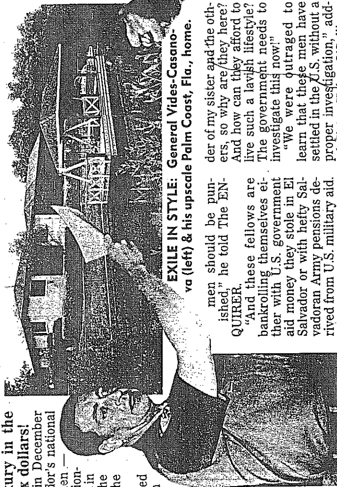
EXILE IN STYLE: General Vides-Casanova (left) & his upscale Palm Coast, Fla., home.

men should be punished," he told THE ENQUIRER .