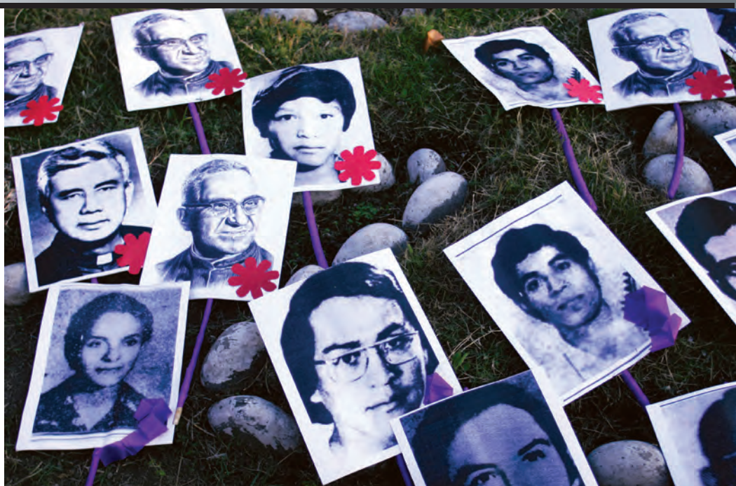
Placards commemorate the victims of the Jesuits Massacre and Archbishop Oscar Romero, assassinated by government forces in 1980.

This indictment came almost three years after CJA and the Spanish Human Rights Association (APDHE) initiated a case before the Spanish National Court for the murders against members of the Salvadoran military. CJA worked closely with Spanish and US authorities to ensure the arrest of the defendants and to expand the case to include six more defendants who were responsible for the massacre.