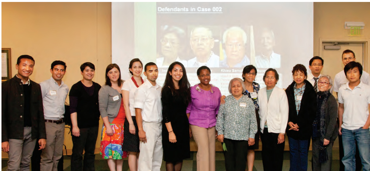
CJA and ASRIC with Cambodian survivors after the forum in Long Beach, CA.