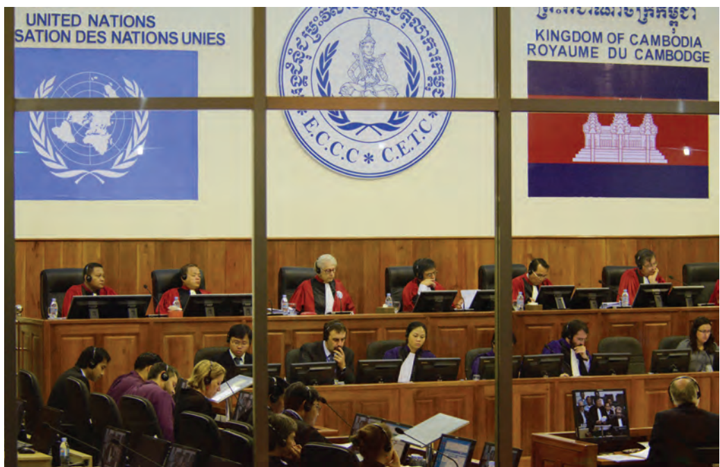
The judges of the Extraordinary Chambers in the Courts of Cambodia, viewed from the public gallery.

CJA attorneys present arguments on behalf of these civil parties in what many consider to be the most complex human rights trial since the Nuremberg Tribunals.