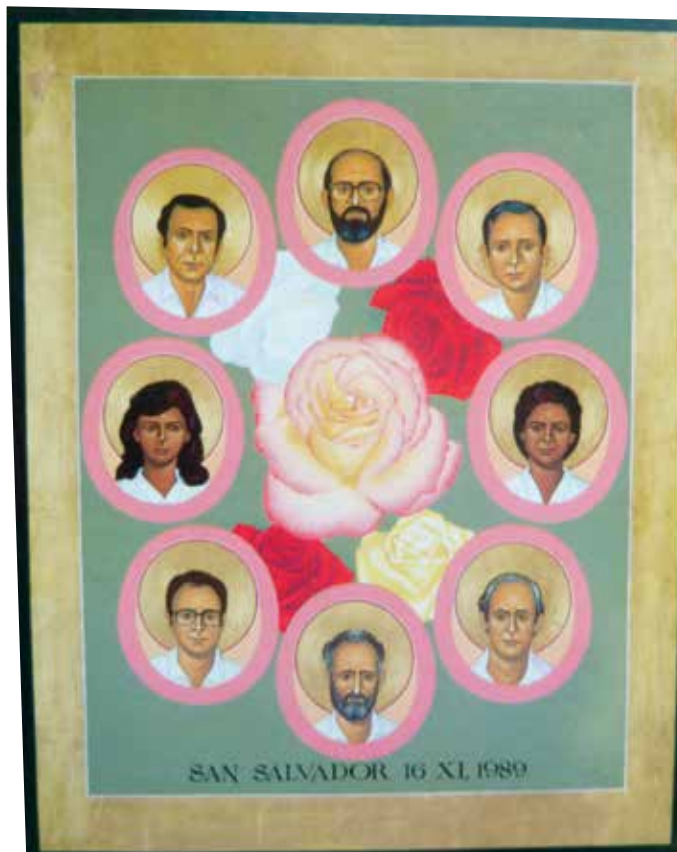
Remembrance card of the six Jesuit priests, their housekeeper and her teenage daughter.

CJA and our clients are not deterred and continue to press the case in Spain. In January 2012, Spain sent formal extradition requests to El Salvador and the United States. The requests are pending in both countries and we continue to work with officials and pro bono co-counsel from Mintz Levin Cohn Ferris Glovsky & Popeo, PC to ensure that they are honored.