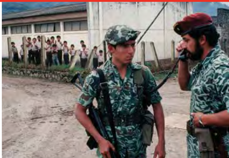
CJA is currently working to prosecute Guatemalan officials for the terrorism, genocide and systematic torture of the Mayan people.