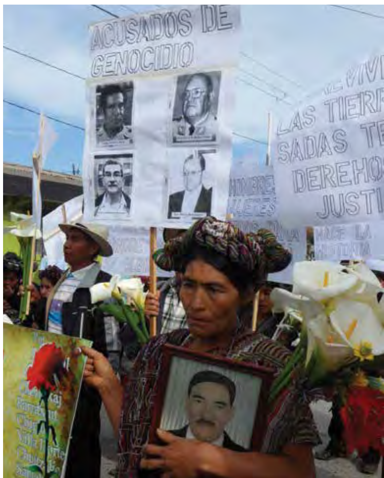
Protesters marching for accountability for the Guatemalan Genocide. Over 200,000 Guatemalans were killed or disappeared during the 1960-1996 internal conflict.