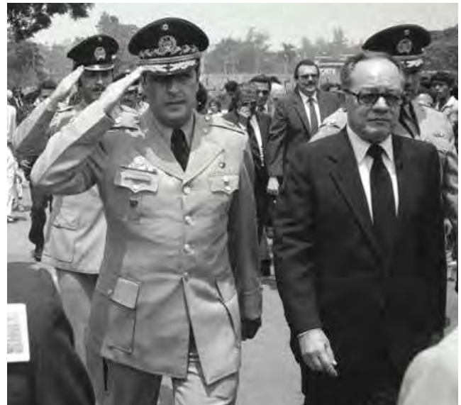
General Carlos Eugenio Vides Casanova (left) oversaw the worst period of human rights violations in El Salvador's history.