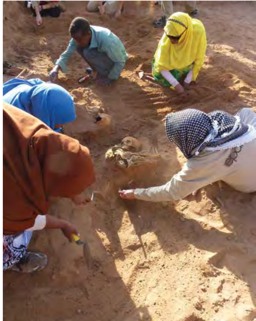
With CJA’s sponsorship the Somaliland government and the Peruvian Forensic Anthropology Team began an international forensic training program in Somaliland.