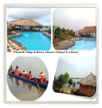
CLICK FOR DETAIL