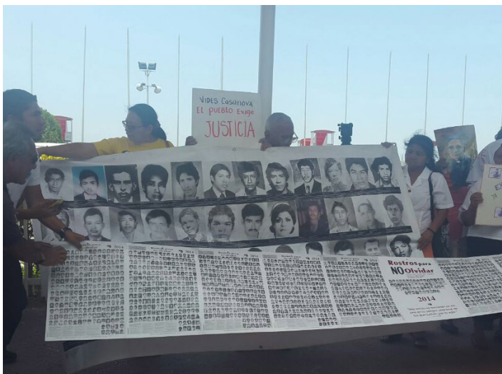
Families await Gen. Vides Casanova's arrival at the airport in El Salvador.