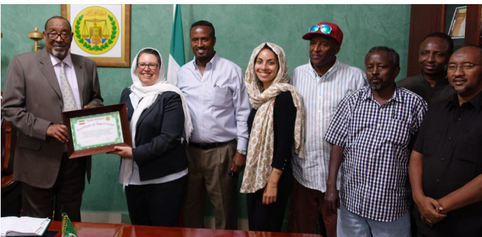
On March 20, 2015, a few weeks after the Supreme Court decision, Somaliland's president presented CJA with the Presidential Commendation for achievements on behalf of victims of human rights violations