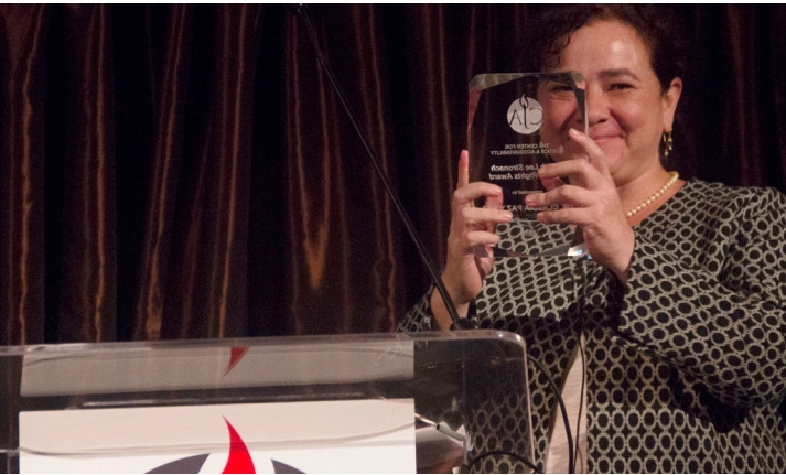
Former Guatemalan Attorney General Claudia Paz y Paz receiving the Judith Lee Stronach Award at CJA's 15th Anniversary Dinner in 2013.

CJA will present the Partner in Justice Award to Chadbourne & Parke LLP , which has provided outstanding pro bono support to CJA in our Jara v. Barrientos case. 🔥