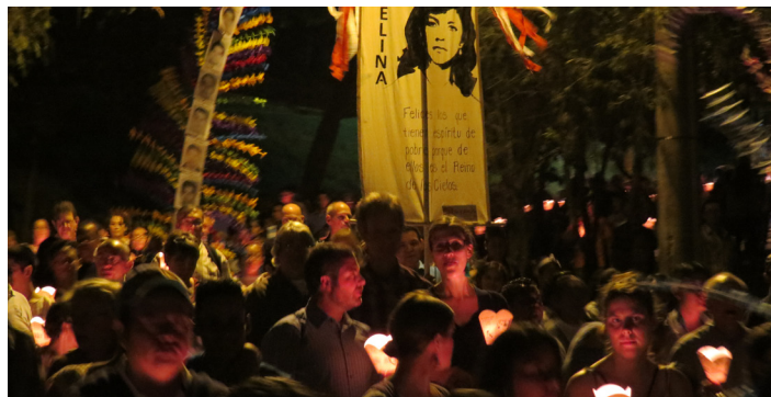
Delegates participate in a candlelight vigil on November 15, 2014