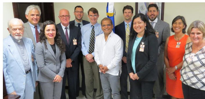
Delegates meet with El Salvador's vice president