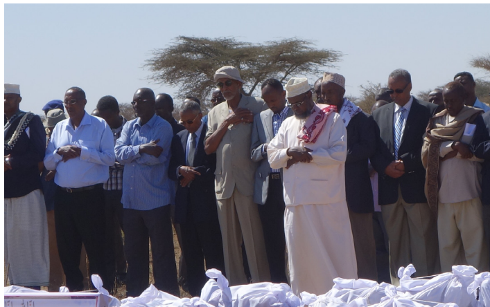
Reburial ceremony for victims of the Siad Barré regime, the brutal dictatorship that ruled Somalia for 22 years. General Samantar was the Prime Minister and Defense Minister during Siad Barré's regime.

A few weeks after the Supreme Court's decision, Somaliland's president, Ahmed Mohamed Mahamoud Silanyo, presented CJA with a commendation for its "extraordinary commitment to human rights." 🇸🇴