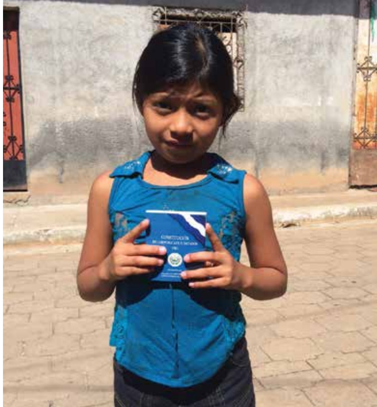
Salvadoran girl holds a copy of El Salvador's constitution, given to her by Florentin Meléndez, a justice on El Salvador's Supreme Court.

The court also issued an extradition request to the United States for the extradition of former Colonel Inocente Montano, a resident of Massachusetts. As a result of the indictment and CJA's advocacy, the Department of Homeland Security filed immigration fraud charges against Montano, and secured a conviction against him in 2012. Montano currently faces an extradition hearing before a district court in the United States that will determine whether he