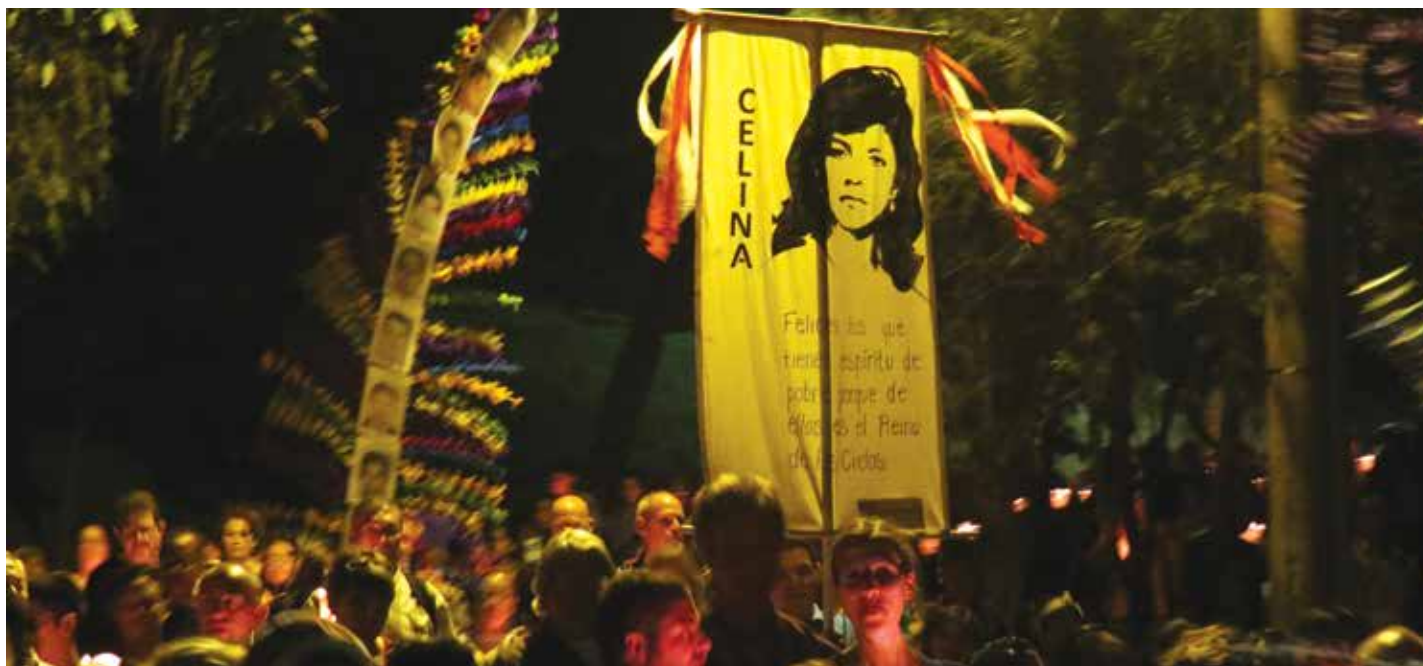
A banner of one of the victims commemorating the 25th anniversary of the Jesuits Massacre in San Salvador.