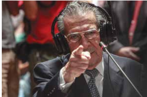
Former President of Guatemala General José Efraín Ríos Montt in the courtroom while on trial for genocide.

The historic trial against Ríos Montt began on March 19, 2013 in Guatemala. In addition to expert testimony, many of the documents that CJA introduced in the case in Spain were introduced