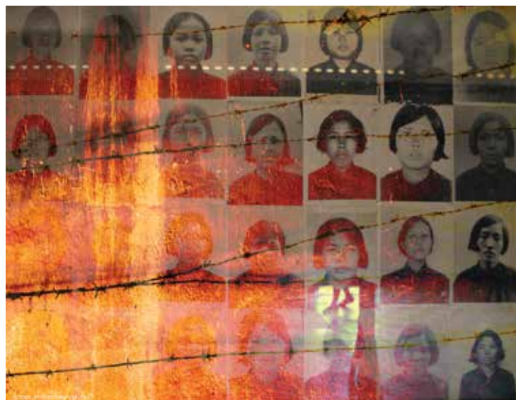
Photos of the victims of the Khmer Rouge at Tuol Sleng Prison, Cambodia.