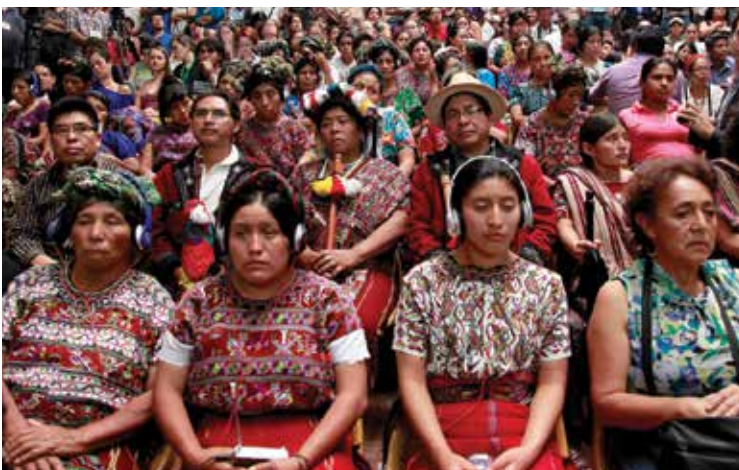
Inside the courtroom at the Ríos Montt genocide trial.

Despite the strides made by civil society and the office of the Attorney General in Guatemala, the Constitutional Court remains vulnerable and highly political. Against a backdrop of intense political lobbying, the verdict was overturned just ten days later. A date for a new trial has been set for February 2015. While it is difficult to predict whether the retrial will proceed free from political interference, it is clear that Ríos Montt will be remembered as the person most responsible for the genocide of the Mayans.